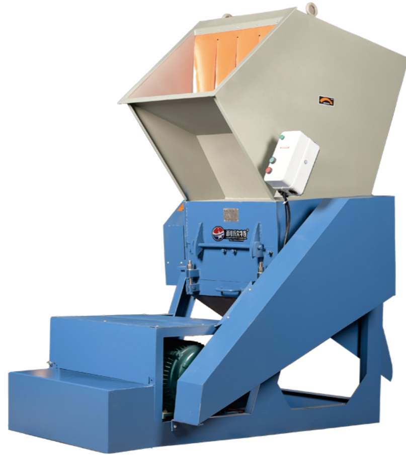
大体积 直接破碎 Large volume directly broken